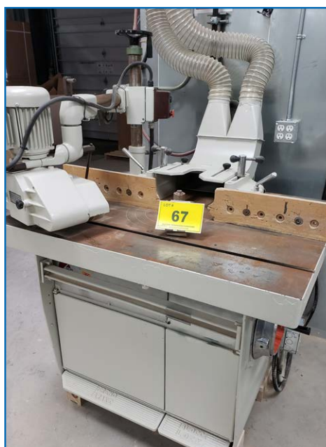
SCM T120C SHAPER