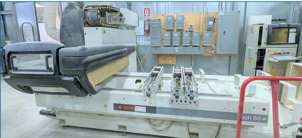
SCM TECH80 CNC ROUTER