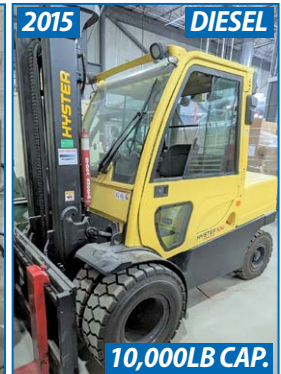
HYSTER H100FT FORKLIFT