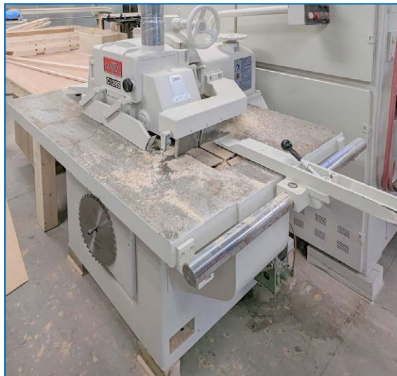
CANTEK C12RS STRAIGHT LINE RIP SAW