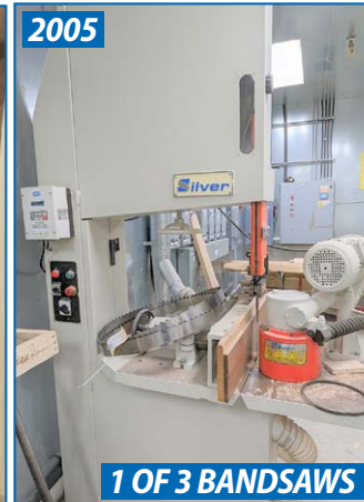
SILVER SH-700 BANDSAW