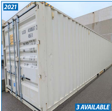
PARTIAL VIEW OF SEACANS