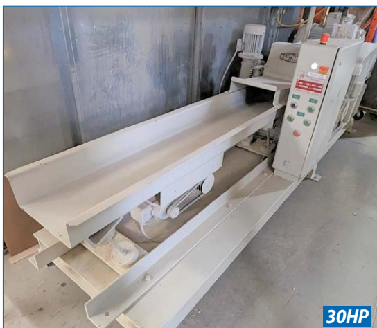
KLOCKNER WOOD GRINDER

PLUS: Wood Lathes, Stroke Sanders, Edge Sanders, Drill Presses, Scissor Lift Tables, Power & Hand Tools, Large Qty. of Moving Blankets & Dollies, Products Transfer Carts, Drying Racks, Racking, Workbenches, Pallet Jacks, Packaging Machines, Toolboxes, Chemical Storage Cabinets, Cantilever Racking, Hardware, Office Equipment & Much More!