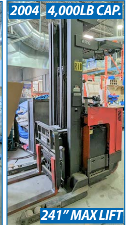
RAYMOND EASI R40TT REACH TRUCK