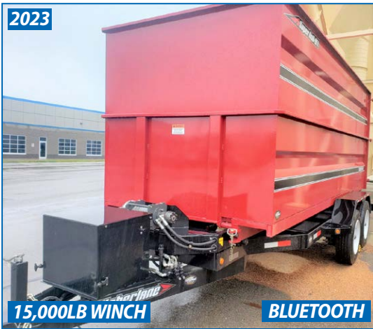
15,000LB WINCH BLUETOOTH WEBERLANE TANDEM AXEL ROLL OFF TRAILER