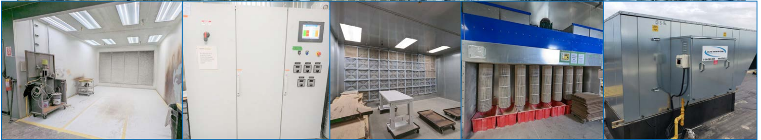
ELITE AIR SYSTEMS CUSTOM FREE STANDING SPRAY BOOTH