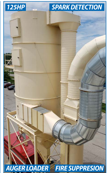
DUST COLLECTION SYSTEM