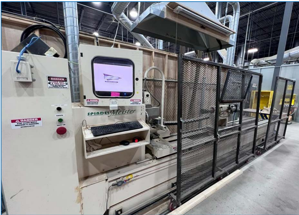
SPINDEL MEISTER 12-20 CNC WOOD LATHE/SHAPER