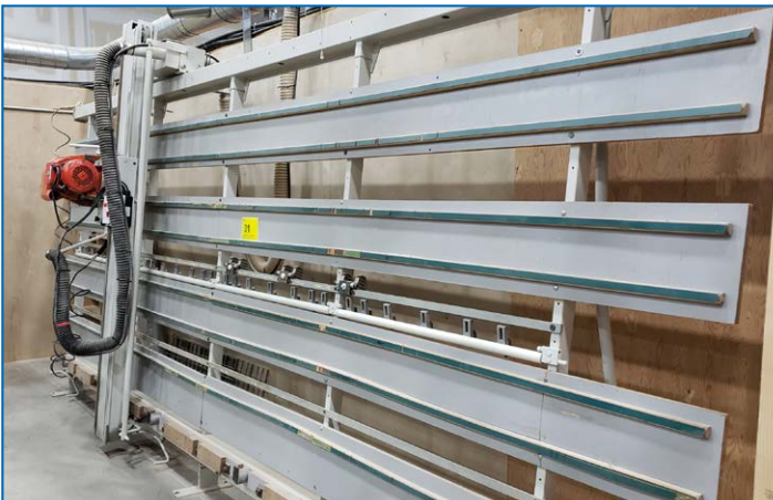
HOLZHER 1205 PANEL SAW