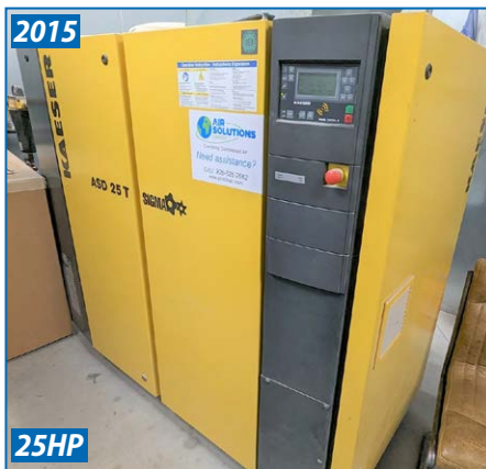
KAESER ASD25T COMPRESSOR

2021 UNITED TRAILERS INC. Tandem Axle Enclosed Trailer, VIN# 56JTE2029NA180607 (3) MOND, TRAILMOBILE, STOUGHTON 53' Storage Trailers