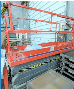
SKYJACK SJIII 3226 SCISSOR LIFT