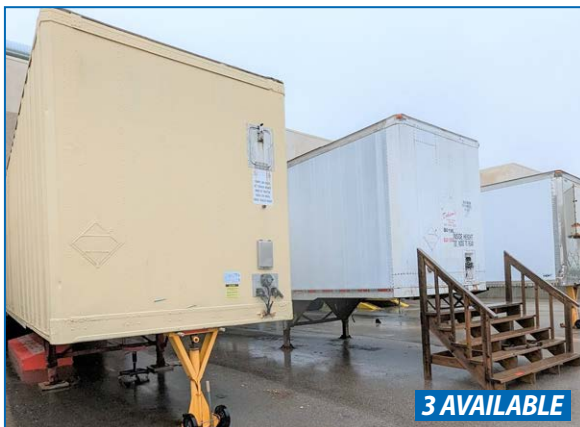
PARTIAL VIEW OF 53' STORAGE TRAILERS

2023 WEBERLANE Tandem Axle Roll Off Trailer, VIN# 2W9800038PR160434, Model WL1678RO 16' Super Roll Off Frame, 16' x 72" Sides, Approx. 20 Yard Cap., Top Sealed Welded Lid w/ Fill Hole, Rear Barn Doors, Rear Auto Frame Locks, Rear Rollers, 3" Wide Flanges w/ Flip Over Sealed Lids on Fill Holes, Tandem Axle w/ Brakes, (2) Electric Axels, ST225/75D15 Tires, 15" x 6 Bolt, 7,000lbs Drop Leg Jack, Polyethylene Tongue Box, 15,000lbs 12V Electric Winch w/ Remote, Twin Lift Cylinders w/ Side Frame Friction Rollers, Rear Auto Frame to Box Locks, Finished in Black Urethane, Tandem 8000 Axels, Electric Gas Hyd. Power Wireless and Cable Control, Bluetooth