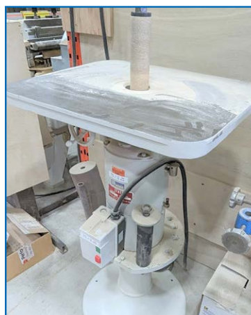
STATE P4 DRUM SANDER