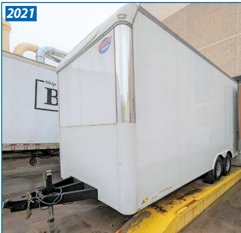
UNITED TANDEM AXEL ENCLOSED TRAILER