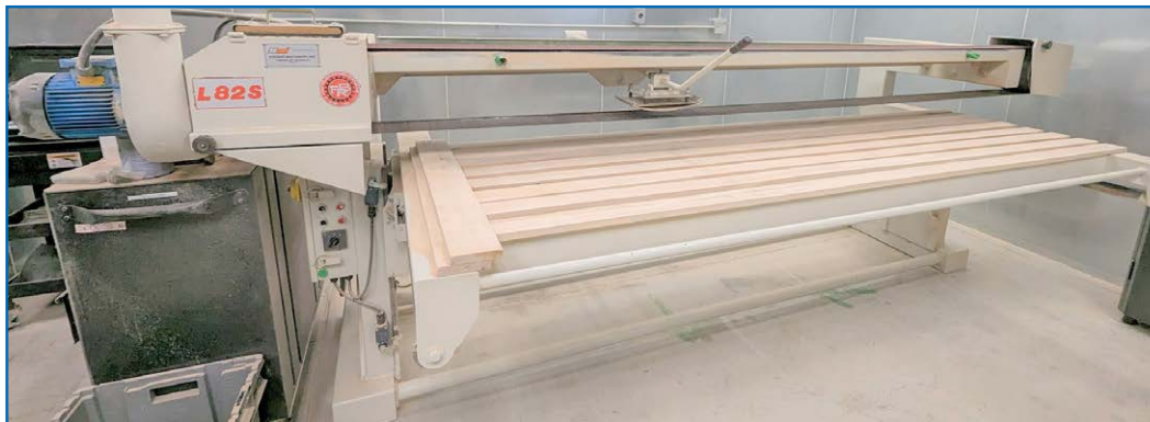
CONSTRUZIONI L82S STROKE SANDER