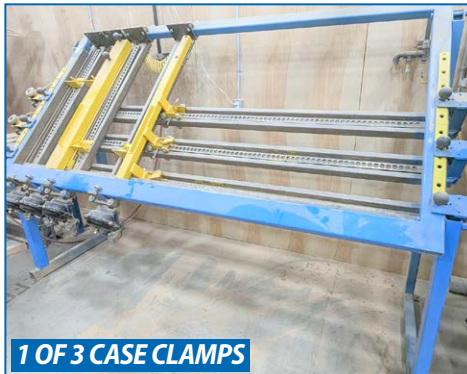
1 OF 3 CASE CLAMPS