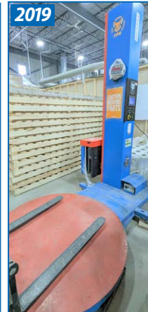
FOX FPS 300 PALLET WRAPPER