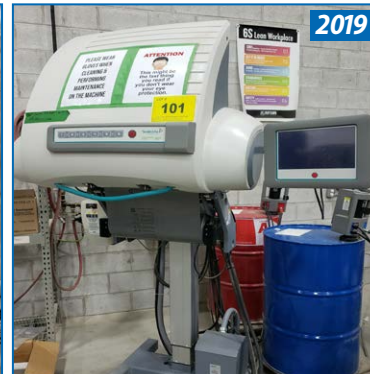
SEALED AIR PACKAGING SYSTEM