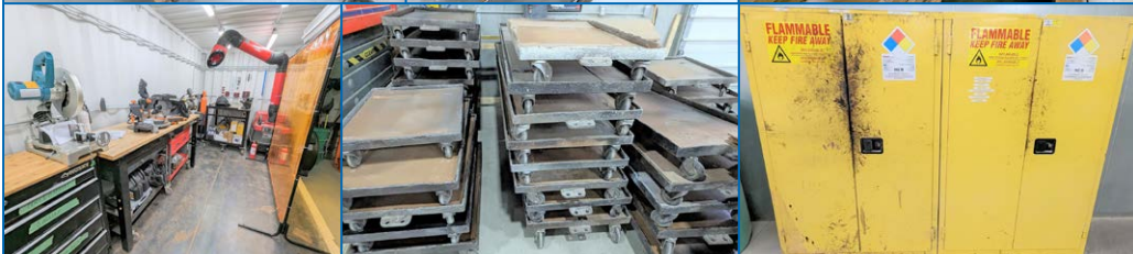
PARTIAL VIEW OF LIVE EDGE SLABS, RAW MATERIALS, PLANT SUPPORT