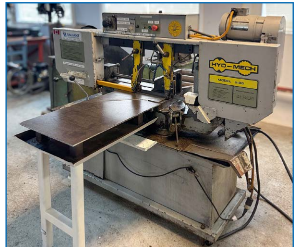
HYD-MECH S-20 HORIZONTAL BANDSAW