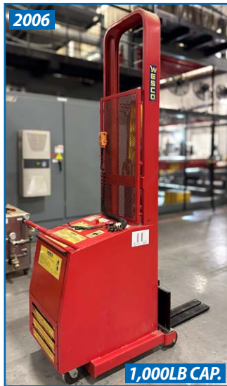
WESCO ELECTRIC STACKER