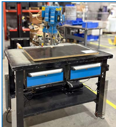
HETTICH DRILL AND INSERTION MACHINE

(2) STEEL CITY 80-210 S3 Dust Collectors, 2HP, 3,450 RPM, Mfg: CT-103, 220V, s/n's 17800030, 17800012