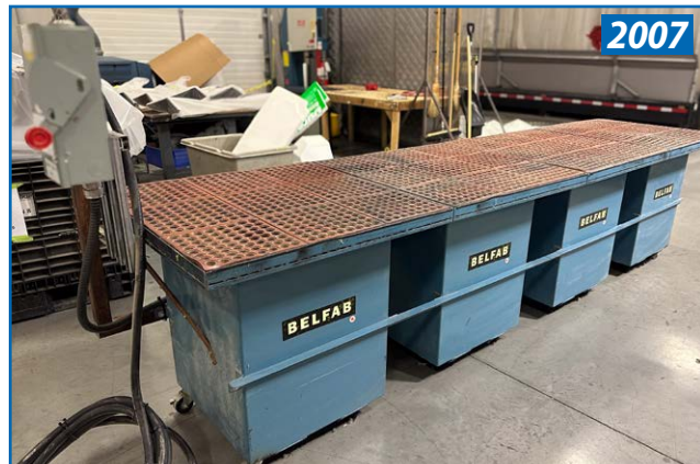
PYRADIA BELFAB DOWNDRAFT TABLE SYSTEM

2007 PYRADIA BELFAB Portable Downdraft Table System Consisting of (4) PYRADIA BELFAB 3636 DT Downdraft Tables, s/n's 2007-04-21799-1, 2007-04-21799-2, 2007-04-21799-3, 2007-04-21799-4