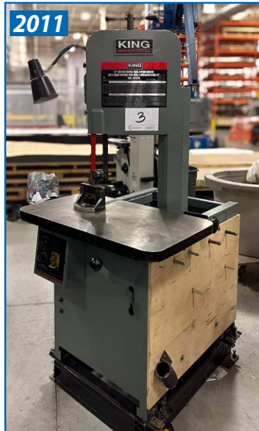
KING INDUSTRIAL KC-914H ROLL-IN SAW