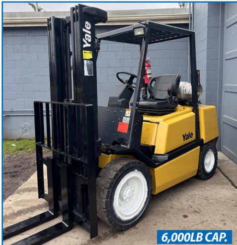
YALE PROPANE OUTDOOR FORKLIFT