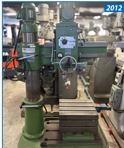
KAO MING KMR-700DS RADIAL DRILL