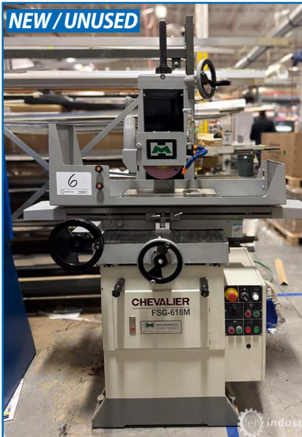
CHEVALIER FSG-618M SURFACE GRINDER