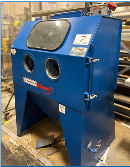
CANABLAST ECAB SERIES SUCTION / SANDBLAST CABINET