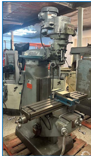
BRIDGEPORT SERIES I VERTICAL MILL