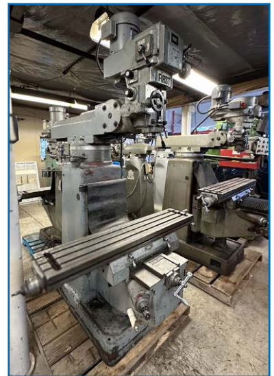
FIRST LC-185VSX VERTICAL MILL